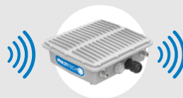
MultiTech IP67 Conduit Gateway