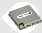
MultiTech xDot Inside