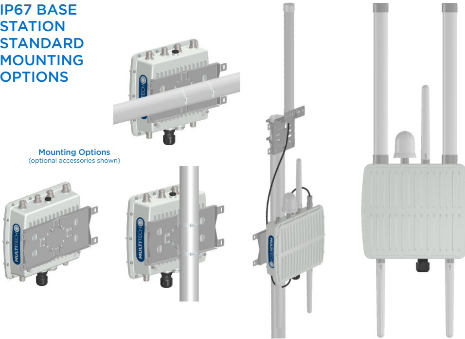
Mounting Options (optional accessories shown)