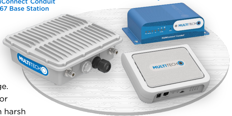
MultiConnect® Conduit® AP Access Point